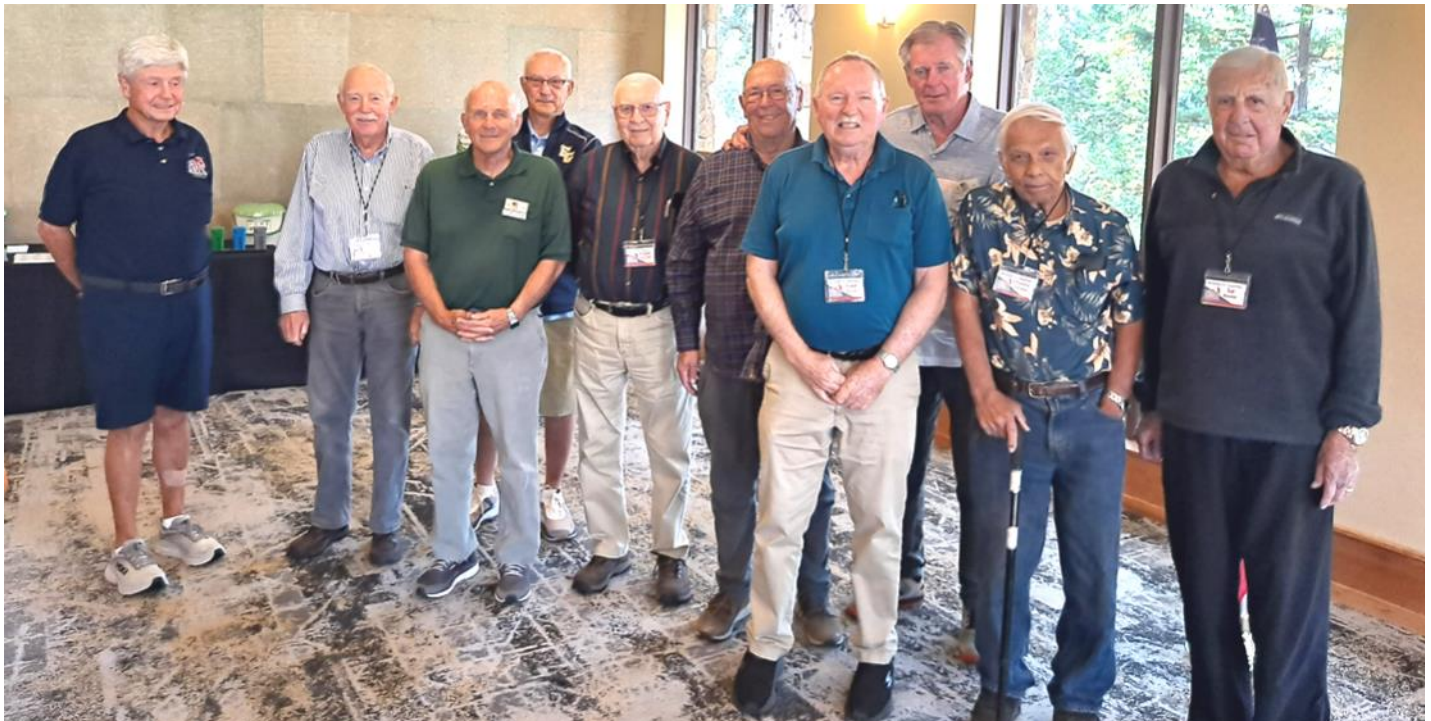
New Members & Sponsors , 9-21-2023.