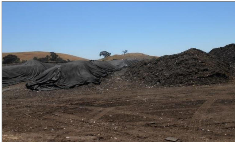
Windrows, 60 - 90 Day Process