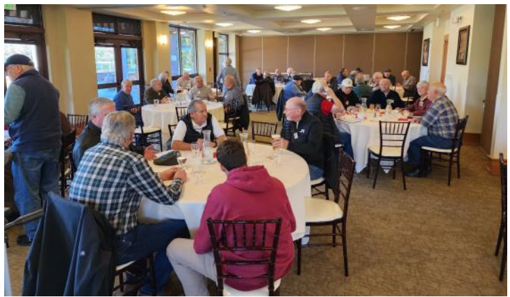
Our new digs (actually old, we returned following the Covid shutdown)

The state organization has also recognized us and is watching our branch. I am proud to be your recruiting chairman. Please work with me again for a successful year. We have a great committee, but they can't do it by themselves. If you have questions or can help out with our recruiting efforts, please contact me at <a href="richdelam-bert@gmail.com">richdelam-bert@gmail.com</a> or call (707) 545-3490.