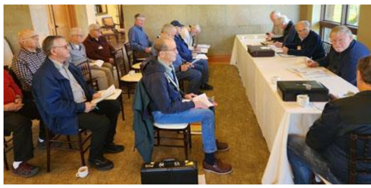
Your BEC hard at work