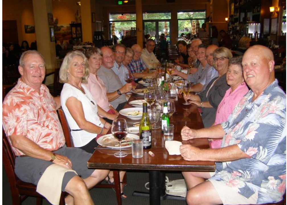
Can you identify any of the people or places?