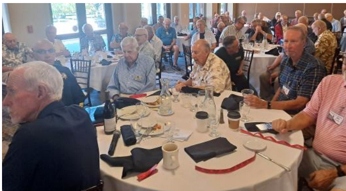
Part of the lunch group at the meeting on October 19, 2023.