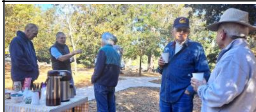
Group at Coffee Club in Howarth Park

To read this edition, go to our SIR Branch 17 website, click on Newsletters, then scroll down almost to the bottom of the screen, then click on the November edition if it is posted. It usually contains lots of interesting articles from many of the other SIR branches from Bakersfield north to the Oregon boarder.