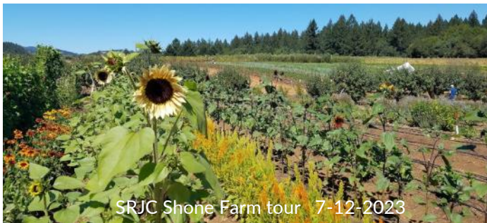
SRJC Shone Farm tour 7-12-2023

Pictures below from various past events.