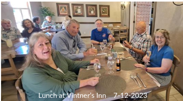
Lunch at Vintner's Inn 7-12-2023