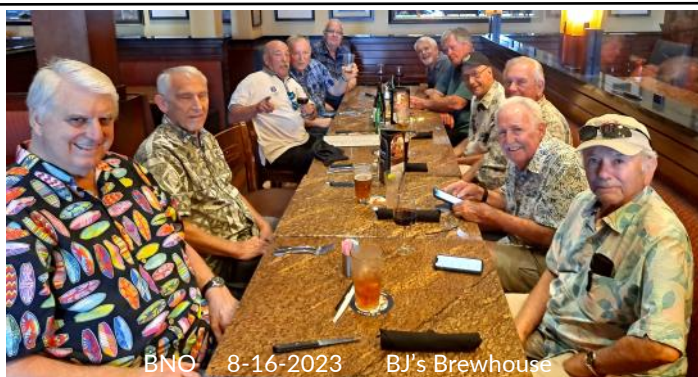
BNO 8-16-2023 BJ's Brewhouse

If you have any questions or would like to be on our email list, call me at 707 291-0271. or send an email to: njmwheeler@science-one.org