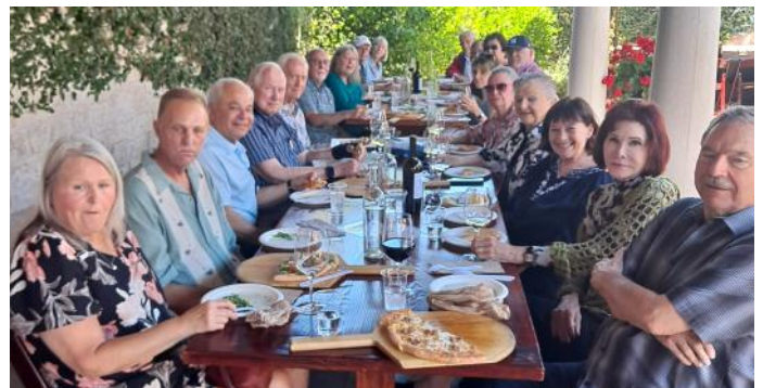
Group enjoying lunch at VJB Vineyard & Cellars in Kenwood on 6-29-2023, with the new lunch outing "Eat & Explore."