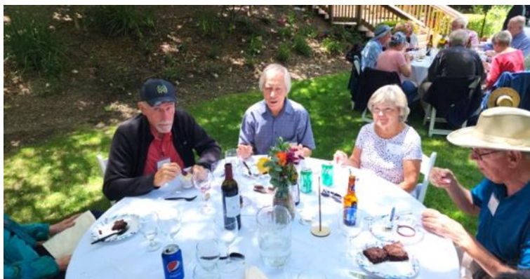
Photo Gallery Annual SIR Brn 17 & 176 PICNIC Lunch